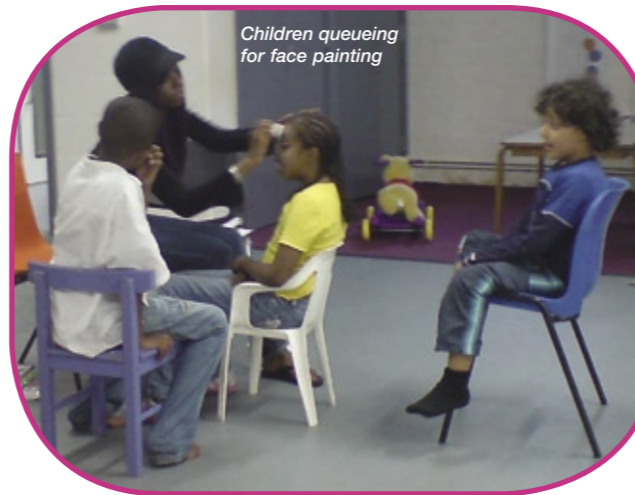
Children queueing for face painting