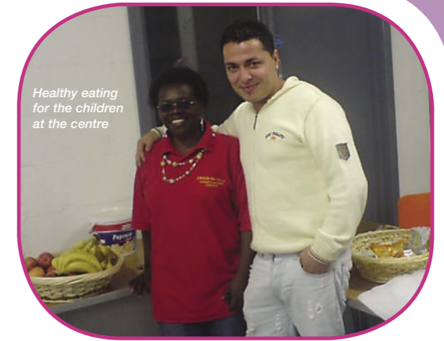
Healthy eating for the children at the centre