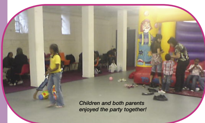
Children and both parents enjoyed the party together!